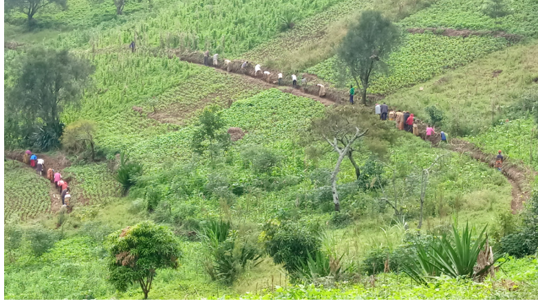
PAPAB developed visible "demonstration sites" in several PIP villages, where complete slopes are treated by PIP farmers with best land management practices, to show how integrated land stewardship can actually stop erosion and stimulate sustainable agriculture. Inhabitants of Wingoma, Muyinga province, have recently dug contour trenches for erosion control.

to tackle erosion on their own land, farmers realize the importance of collective action at a community- and landscape-level.