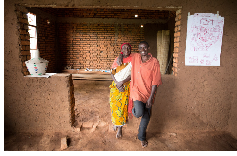
The common creation of their PIP increased equity and togetherness in the Nzokirantevye family.

"There is peace in our household. We produce enough food and sometimes the children make their own suggestions what to eat! The school fees for 5 children and health care for all of us are paid. We live in a house with a renewed roof and a domestic drinking water installation to alleviate the work of my wife and children, paid with the income generated by our farming activities and the Village Savings and Loan Association."