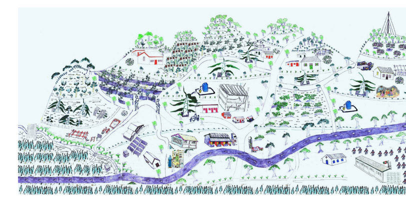
A Village Vision developed by members of the Rwezamenyo community. In the 'Village Visions', inhabitants draw their desired future village scenario (including a road) and create a plan to jointly work towards it.

Acting collectively and achieving visible change stimulates the social cohesion in PIP villages. Often the whole dynamic changes in these villages, with